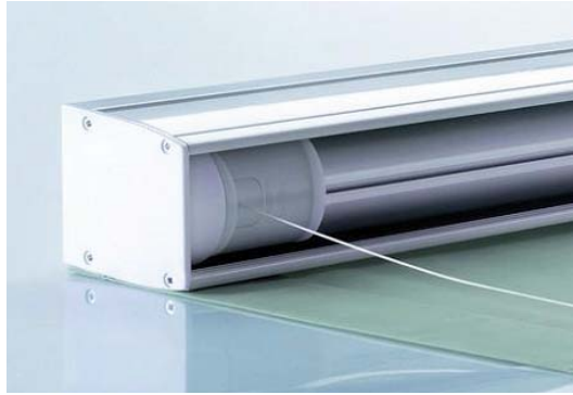
The system Silent Gliss 2350 uses the same easy wind-up mechanism as the systems Silent Gliss 2320 and 2330