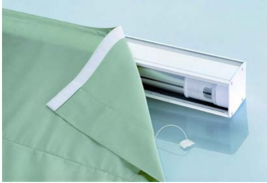
Velcro tape and removable pins for simple take off and easy cleaning